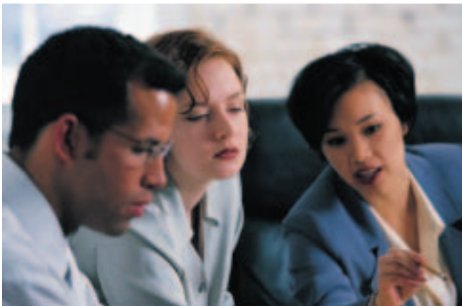
Better information, more control for less effort

Innate has the look and feel of a traditional spreadsheet through its multi-user web based interface, and superb synchronisation with Microsoft Project.